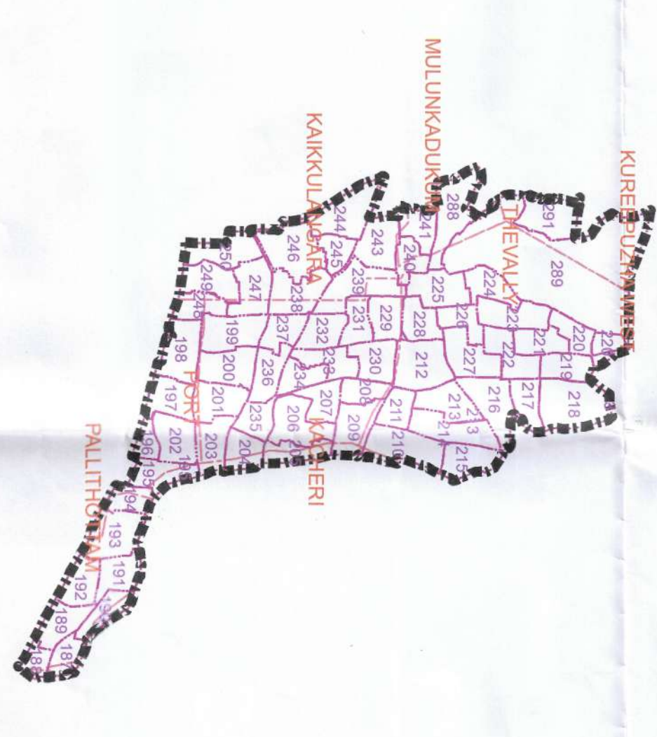
Legend Village Boundary Stock Boundary Village P? Boundary